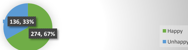
Fig 1 : Distribution of Happiness among participants

Happy group comprises 209 (76.3%) were males and 65(23.7%) were females. Second year MBBS