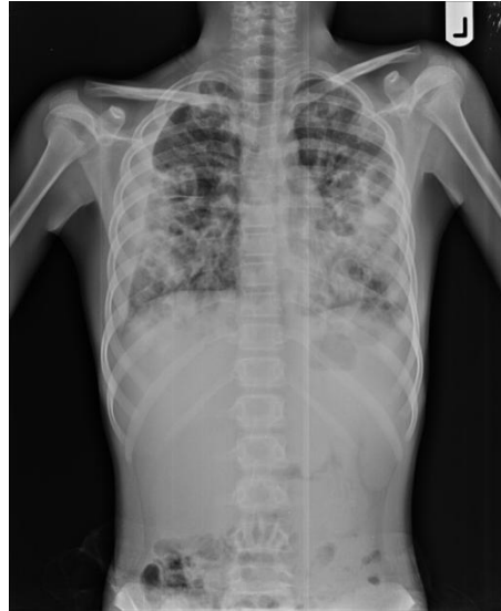
Figure 2 Chest X ray prior to treatment (case 2)